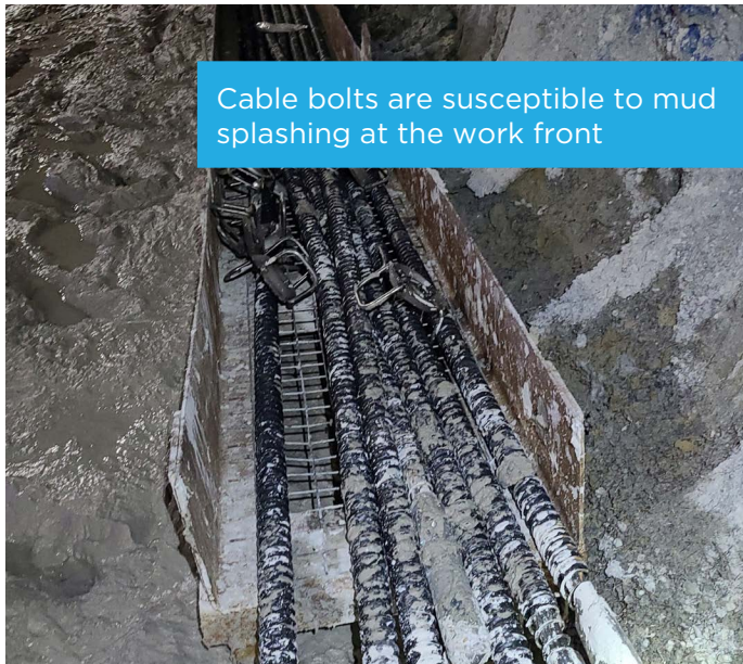
Cable bolts are susceptible to mud splashing at the work front

Due to their long length (6.5m-8.5m) and requirement to be used at work fronts where they are susceptible to mud splashing, keeping cable bolts clear of debris prior to installation can prove a challenge.